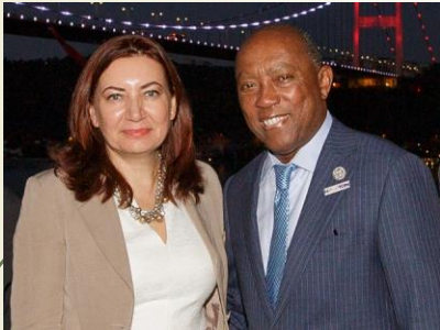
Sylvester Turner Mayor of Houston